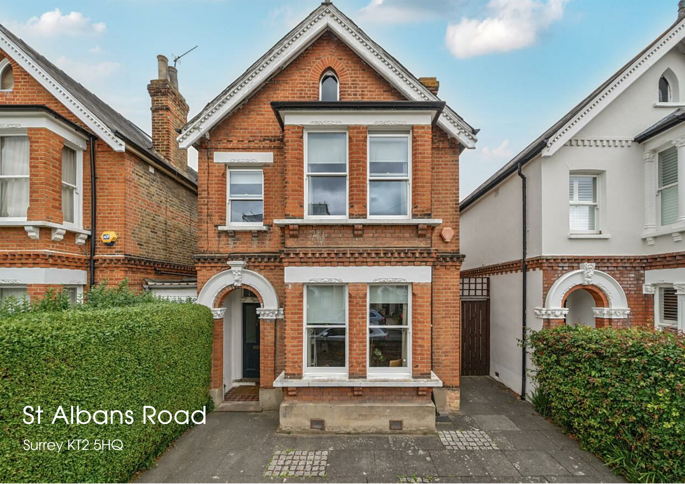
St Albans Road Surrey KT2 5HQ

Important Information All appliances listed in these details are only 'as seen' and have not been tested by Gibson Lane, nor have we sought certification of warranty or service, unless otherwise stated. Measurements, areas and distances are approximate. Floor plans and photographs are for guidance purposes only and must not be relied upon for any purpose. These details are offered on the understanding that all negotiations are made through this company. Neither these particulars, nor verbal representations, form part of any offer or contract, and their accuracy cannot be guaranteed.